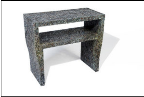
One Day Paper Waste by JensPraet / Droog Design