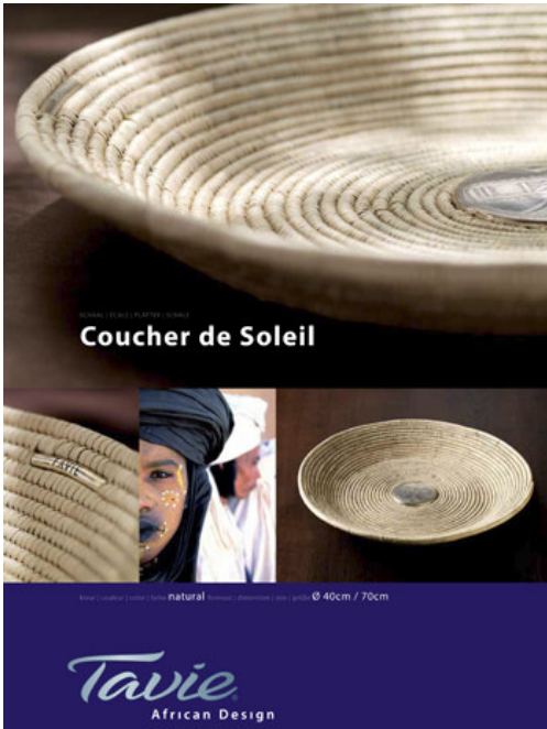
Tavie by Cecile Meeuwsen & African Artisans / Tuttobene