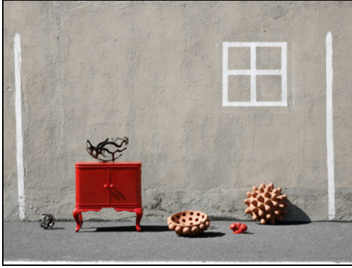
The Bastar Collection by Who Made & Saathi Tribal Crafts