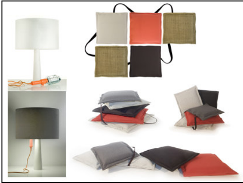
Comfort & Light by Mart'i Guix'e / Green Energy Design