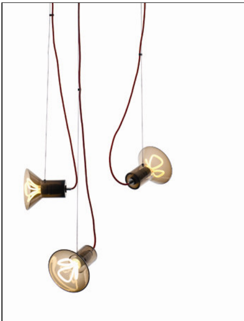
watts new by Lotte van Laatum