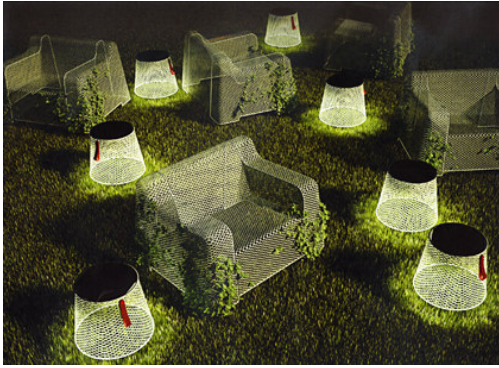
Ivy by Paola Navone / Green Energy Design