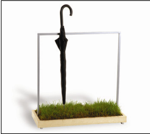
Take Care by What else / Satellite