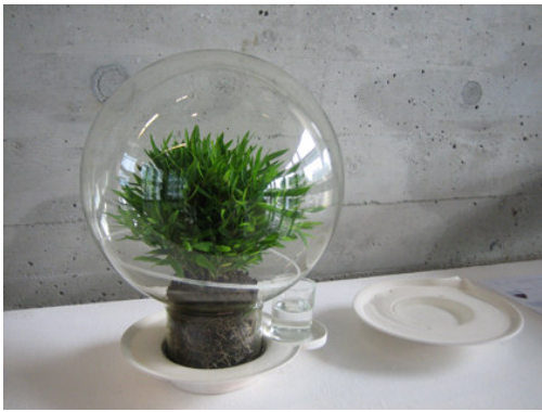
Water evaporation by Hanneke geurts vanKessel / Design Academy Eindhoven