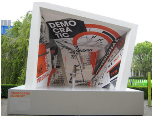
Democratic Ecology by Philippe Starck / Green Energy Design