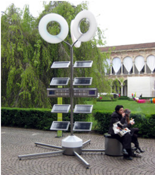
Sunplant by Toshiyuki Kita / Green Energy Design